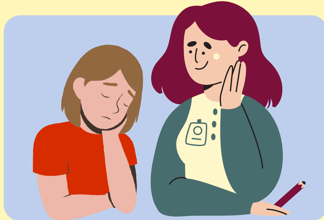
If you see or experience bullying, tell about it to an adult