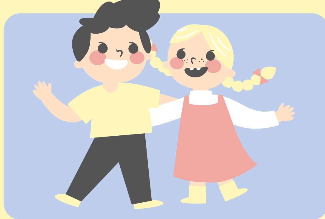
Respect each other