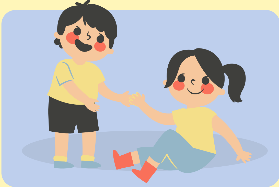
Help each other