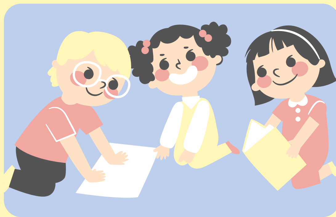
Be kind to everyone