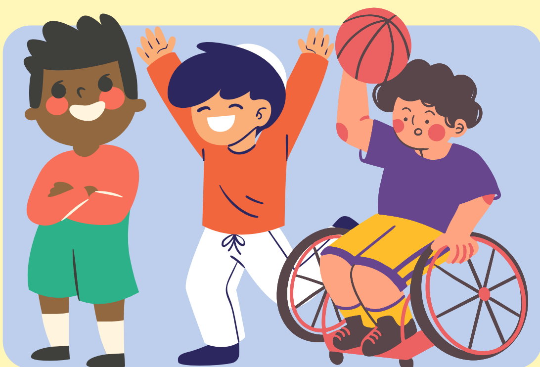
treat everyone equally